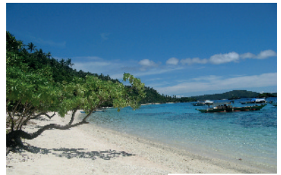
Dive Spot 3