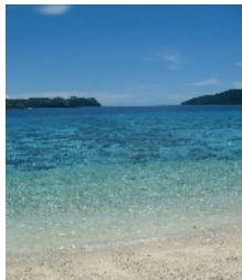
Dive Spot 2