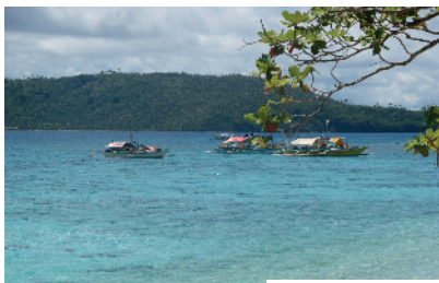
Dive Spot 1

It is not a holiday, it can be hard work, but it will be rewarding, varied and interesting work and there will be plenty of time to relax with your new found friends and enjoy all this stunning country and its hospitable people have to offer.